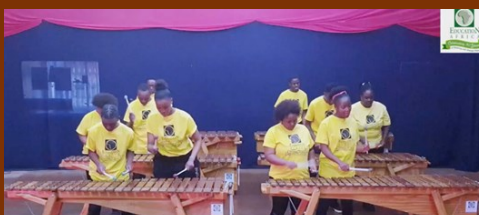
OS3: EDUCATION AFRICA ALUMNI ALL STARS MARIMBA BAND GAUTENG, SOUTH AFRICA