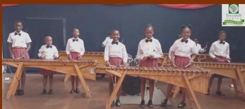
PS3: JOHN WESLEY COMMUNITY CENTRE GAUTENG, SOUTH AFRICA

You can watch the festival on their YouTube page: https://www.youtube.com/channel/UCMsei0CNAvqGHNElek4P5rg