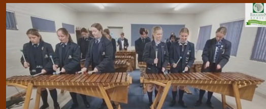
HL3: CURRO HILLCREST HIGH SCHOOL KWAZULU-NATAL, SOUTH AFRICA