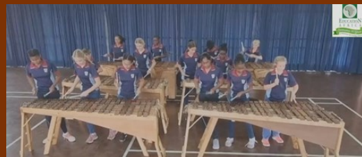
PL3: WESTVILLE SENIOR PRIMARY SCHOOL KWAZULU-NATAL, SOUTH AFRICA