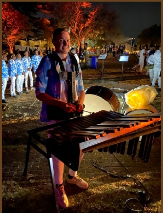
Our Marching Marimba was featured at The Brixton Light Festival.