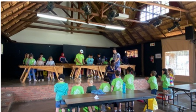
We had a great time doing marimba and percussion workshops at The American International School Pretoria Campus.