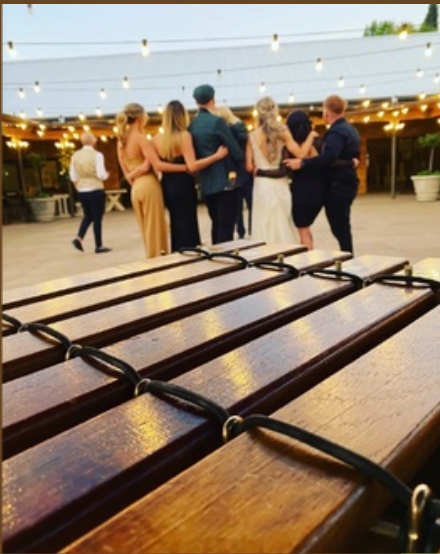
Our company band performed at a number of beautiful weddings and end-of-year corporate events!