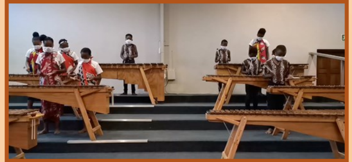
John Wesley Community Centre