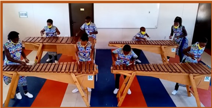
Sekampaneng Primary School