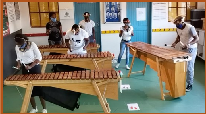
Boys and Girls Club Pimville

Out of the 46 Institutions from around the world we are proud that more than 60% percent of the bands are part of The Marimba Workshop Family. In particular we would like to highlight the following bands who won category awards at the Virtual Festival, showing that The Marimba Workshop instruments stand out both musically and educationally above the rest!